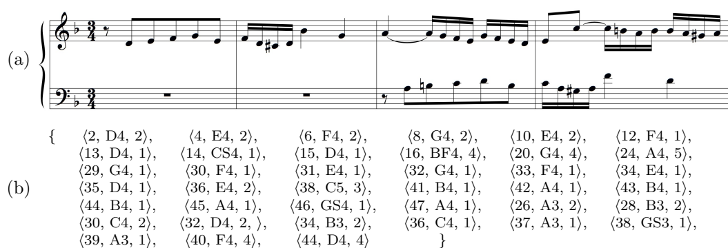
Figure 3: (a) Bars 1 to 4 of Bach's Fugue in D minor from Book 1 of Das Wohltemperirte Klavier (BWV 851). (b) The OPND representation of the score in (a).