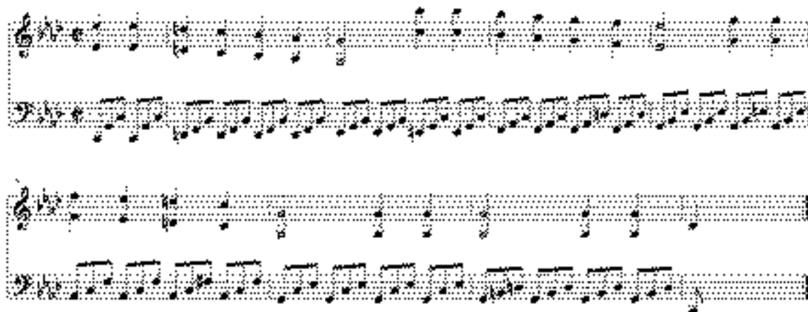
Figure 2. Bars 36–42 of the fourth movement of Beethoven’s Piano Sonata in F minor, Op.2, No.1.