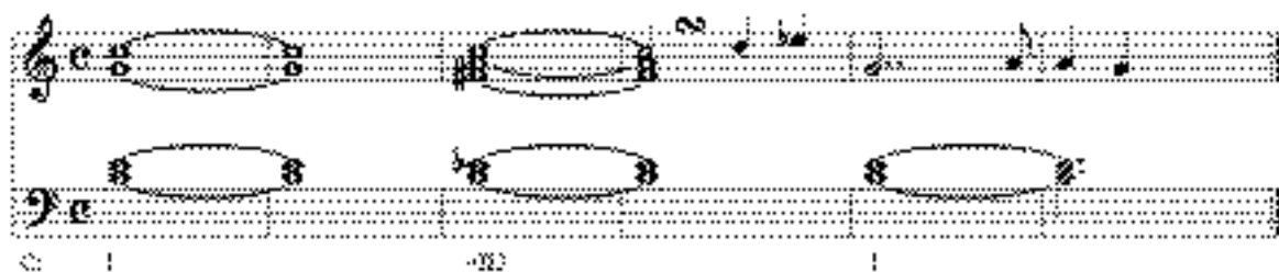
Figure 5. Example of ambiguous pitch spelling. (From Piston, 1978, p. 390.)