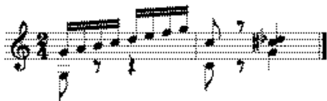
Figure 3. The spelling of the upper note in the final chord cannot be determined. (From Temperley, 2001, p. 121.)